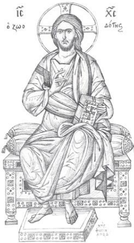
Ἐπιθρονος Χριστός, Ζωοδότης. (Φ. Κόντογλου, 1962).

Monthly magazine and newsletter published by the Holy Cross Synodia