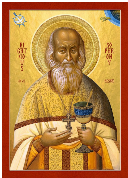
The icon of newly-canonised elder Sophrony of Mt Athos and Essex.

Saint Silouan, together with your disciple Father Sophrony, pray to God that we may be faithful to the Orthodox Church and love all Christians and all people.