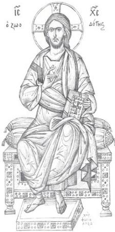
Ἐσθρονος Χριστός, Ζωοδότης. (Φ. Κάρτογλου, 1962).

Monthly magazine and newsletter publicised by the Holy Cross Synodia