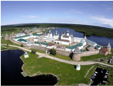
Solovetsky Monastery, Russia