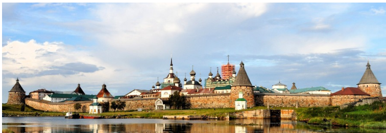
Solovetsky Monastery, Russia

Please send us the names of your departed loved ones and date of their departure in order for them to be remembered.