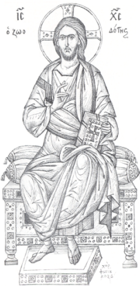
Ἐθρονος Χριστός Ζωοδότης. (Φ. Κόντογλου, 1962).

Monthly magazine and newsletter publicised by the Holy Cross Synodia