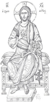
Ἦθρονος Χριστός, Ζωοδότης. (Φ. Κόντογλου, 1962).

a monthly magazine & newsletter published by the 'Holy Cross Synodia'