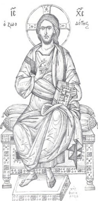
Εὐαγγέλιον Χριστοῦ, Ζωοδότου. (Φ. Κόντογλου, 1962).

a monthly magazine & newsletter published by the 'Holy Cross Synodia Press'