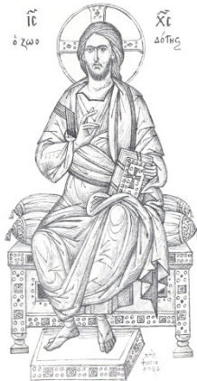
Ἐθρονος Χριστός, Ζωοδότης. (Φ. Κόντογλου, 1962)

The Parish of the Holy and Life-Giving Cross, belongs to the Antiochian Orthodox Deanery of the United Kingdom and Ireland, which is part of the Antiochian Orthodox Archdiocese of Western and Central Europe.