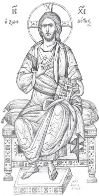
ἸϞϞϞ Χριστός, Παντοκράτης. (φ. Κόντογλου, 1962)

The parish of the Holy and Life-Giving Cross, belongs to the Antiochian Orthodox Deanery of the United Kingdom and Ireland, which is part of the Antiochian Orthodox Archdiocese of Western and Central Europe.