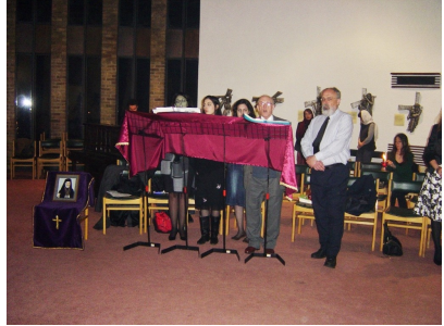
Liturgy of the Resurrection: