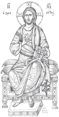
Ἰσθρονος Χριστός, Ζωοδότης. (φ. Κόντογλου, 1962)

The parish of the Holy and Life-Giving Cross, belongs to the Antiochian Orthodox Deanery of the United Kingdom and Ireland, which is part of the Antiochian Orthodox Archdiocese of Western and Central Europe.