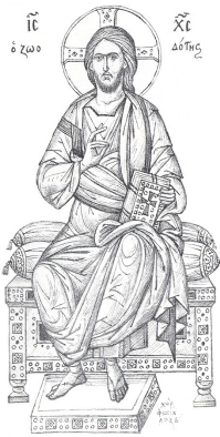
Ἰσχυρὸς Χριστὸς Ζωοδότης. (φ. Κόντογλου, 1962)

The parish of the Holy and Life-Giving Cross, belongs to the Antiochian Orthodox Deanery of the United Kingdom and Ireland, which is part of the Antiochian Orthodox Archdiocese of Western and Central Europe.