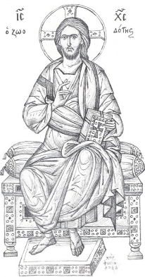
Ἦθηρος Χριστός, Ζωοδότης. (Φ. Κόντογλου, 1962).

The parish of the Holy and Life-Giving Cross, belongs to the Antiochian Orthodox Deanery of the United Kingdom and Ireland, which is part of the Antiochian Orthodox Archdiocese of Western and Central Europe.